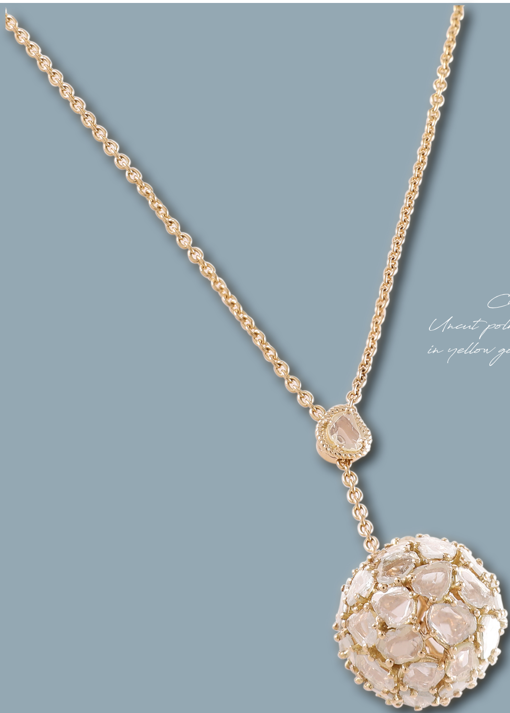
Chain Zero 2 Uncut polki diamonds set in yellow gold.