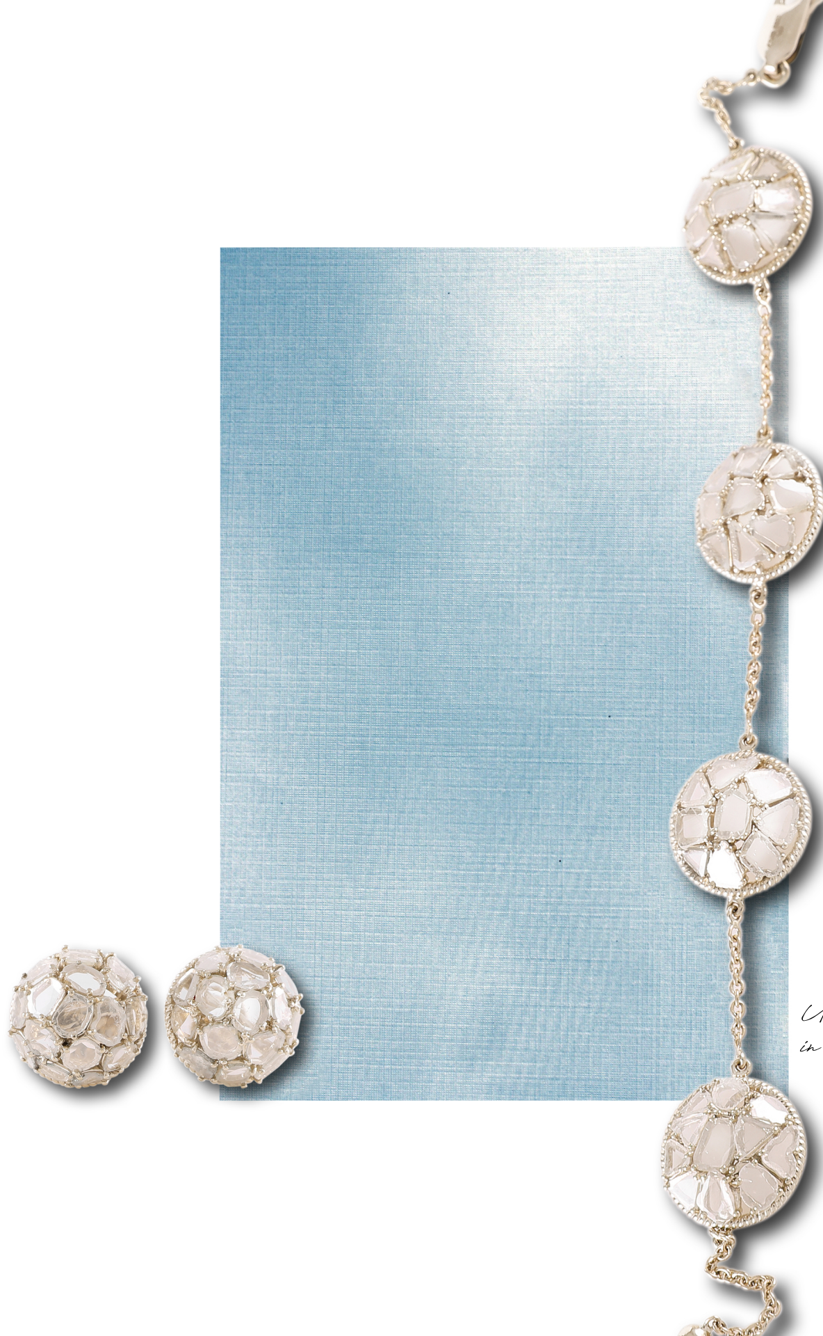
Bracelet Zero 1 Uncut polki diamonds set in white gold.