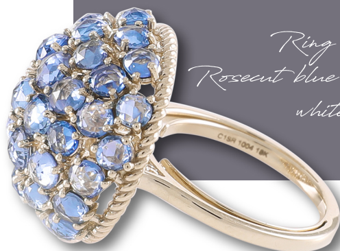
Ring Zero 1 Rosecut blue sapphires set in white gold.