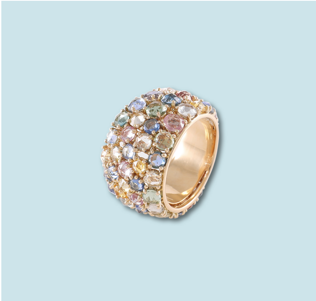
Ring Zero 3 Rosecut multicoloured sapphires set in yellow gold.