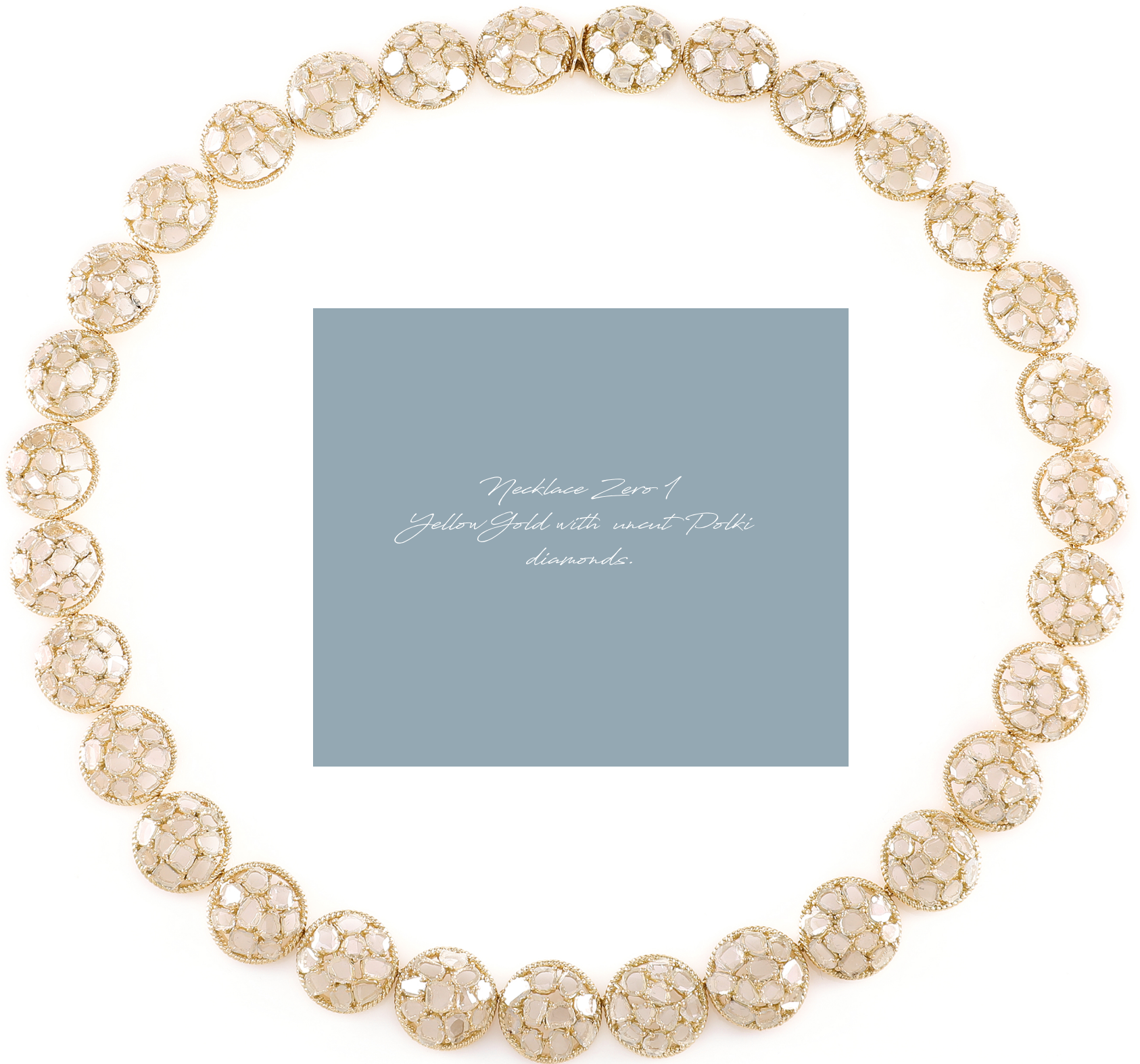
Necklace Zero 1 Yellow Gold with uncut Polki diamonds.