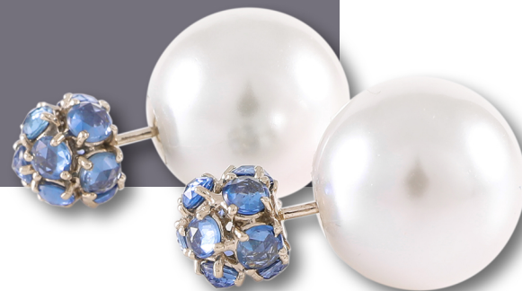
Earring Zero 2 Rosecut blue sapphires set in white gold with shell pearl.