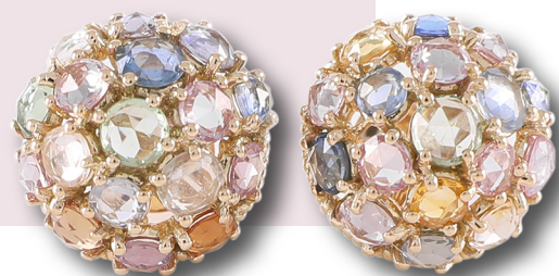
Earring Zero 1 Rosecut multicoloured sapphires set in yellow gold.