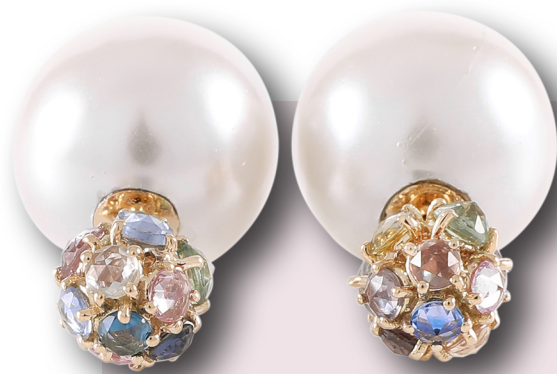
Earring Zero 2 Rosecut multicoloured sapphire set in yellow gold, with shell pearl.