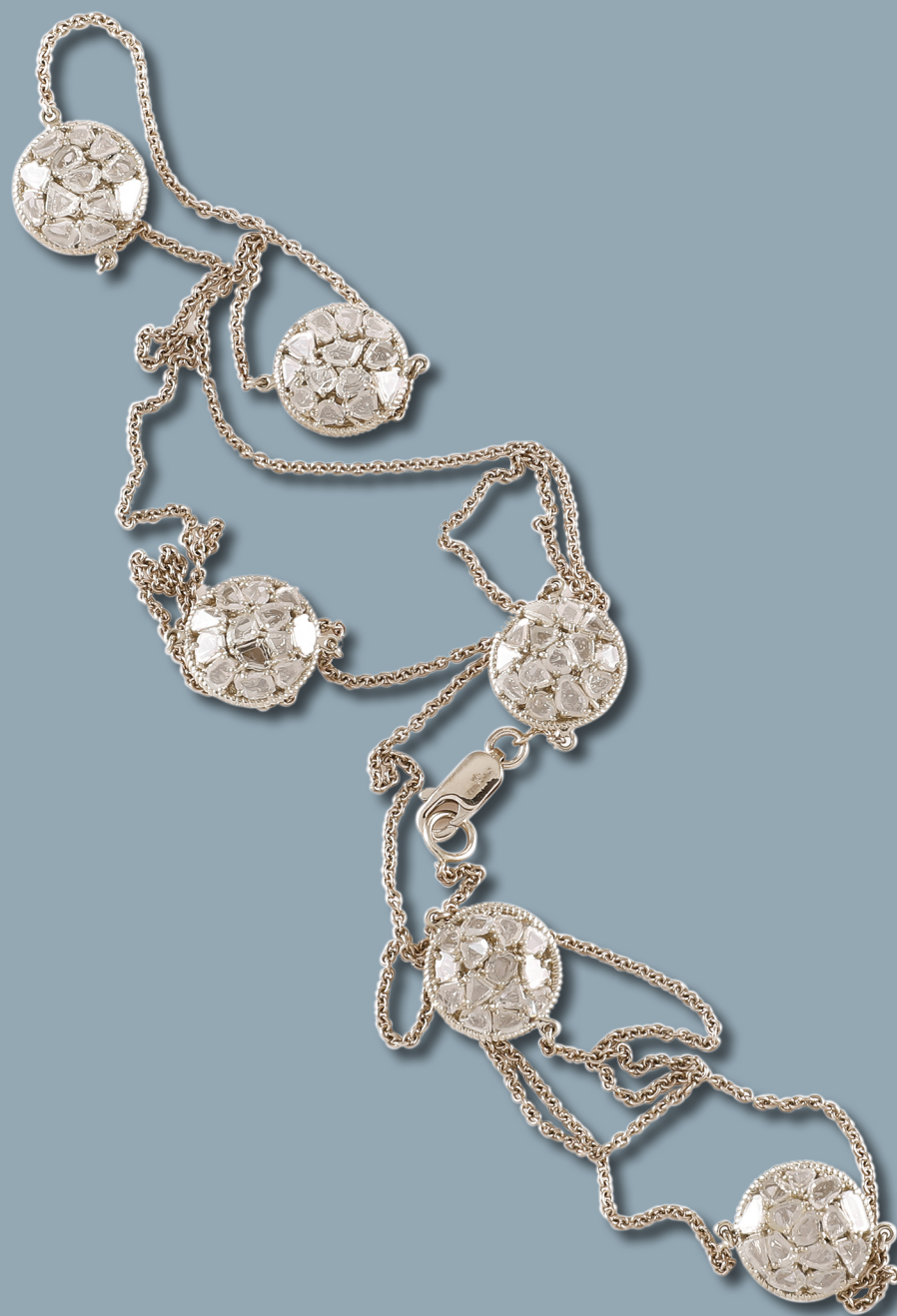
Chain Zero 1 Uncut polki diamonds set in white gold.