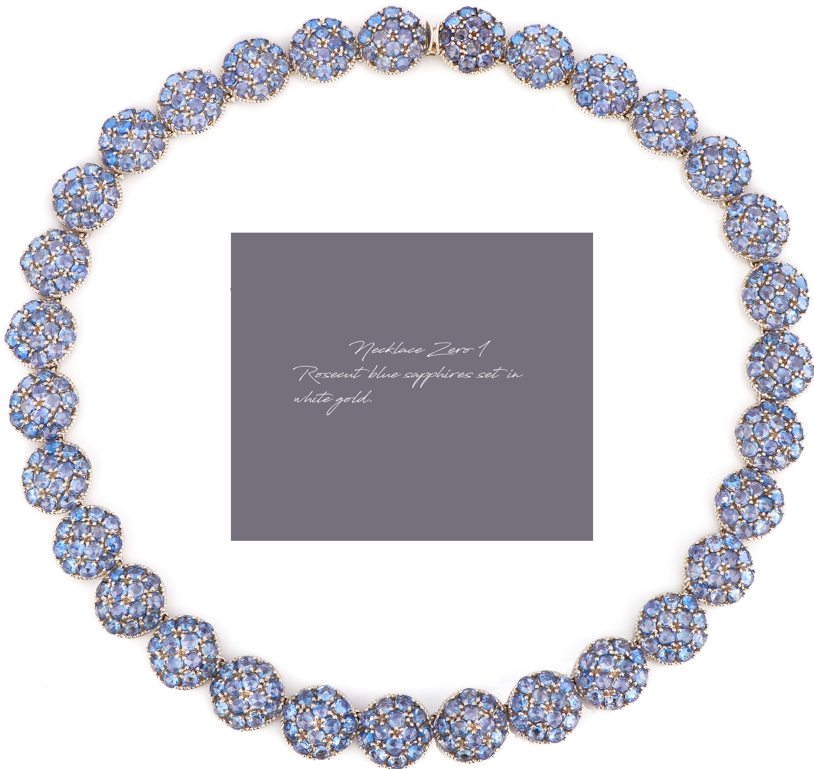
Necklace Zero 1 Rosecut blue sapphires set in white gold.