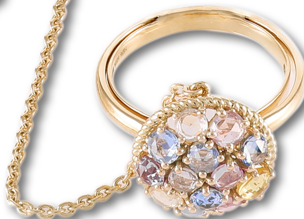
Bracelet Zero 2 Rosecut multicoloured sapphires set in yellow gold.